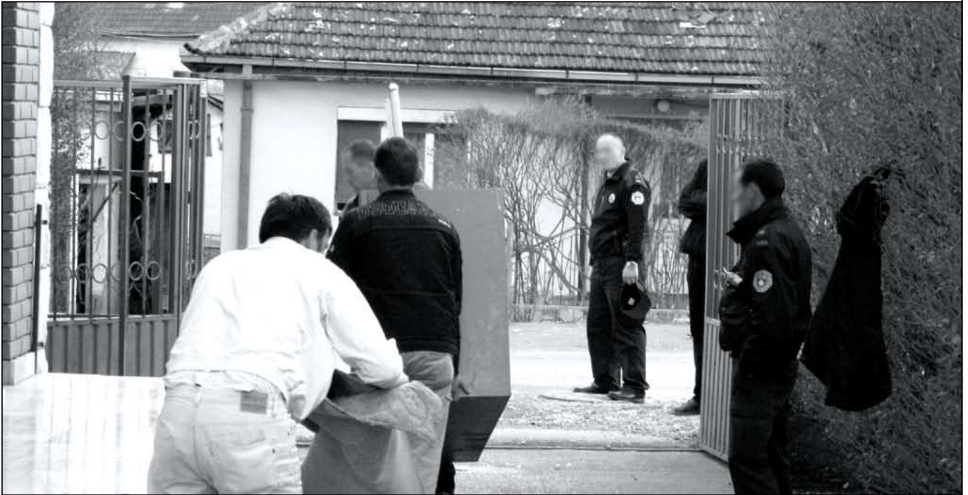
By police assistance, KPA evicted illegally occupant from one house in Pejë/Peć